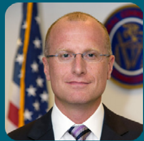
Brendan Carr FCC Commissioner